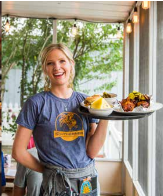
← BUTTER AND WHISKEY Saugatuck This pub uses locally sourced ingredients when possible for all of your favorites.