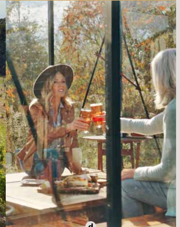
a The Mitten Brewing Company hits a home run with craft beer and pizza in its baseball-themed microbrewery in Saugatuck.