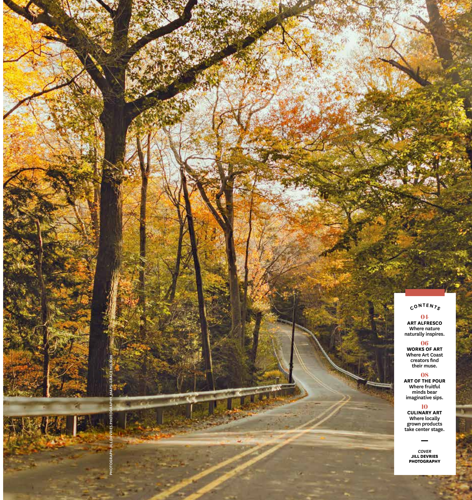
MAPS: GRACE NELSON

Hover your phone's camera over the code for more things to see and do in the area.