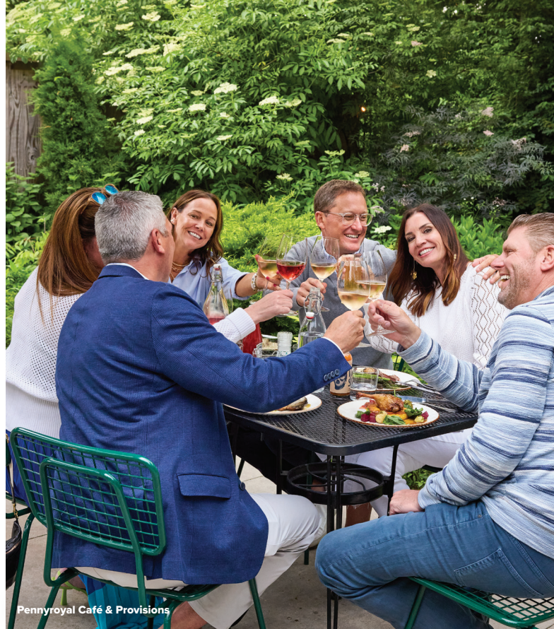
Pennyroyal Café & Provisions