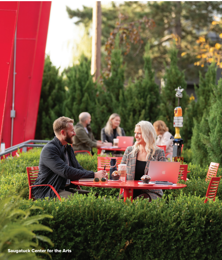
Saugatuck Center for the Arts