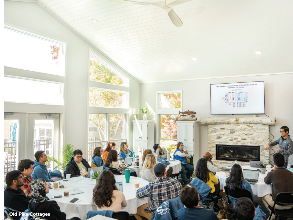
Old Pike Cottages

Discover the ideal meeting space and lodging for your group at saugatuck.com .