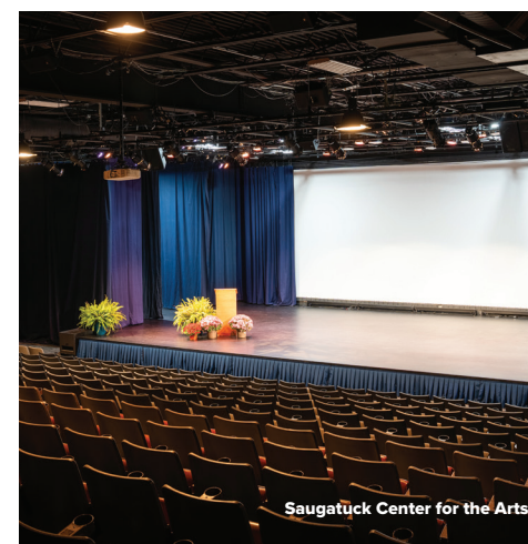
Saugatuck Center for the Arts