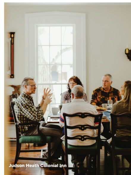
Judson Heath Colonial Inn